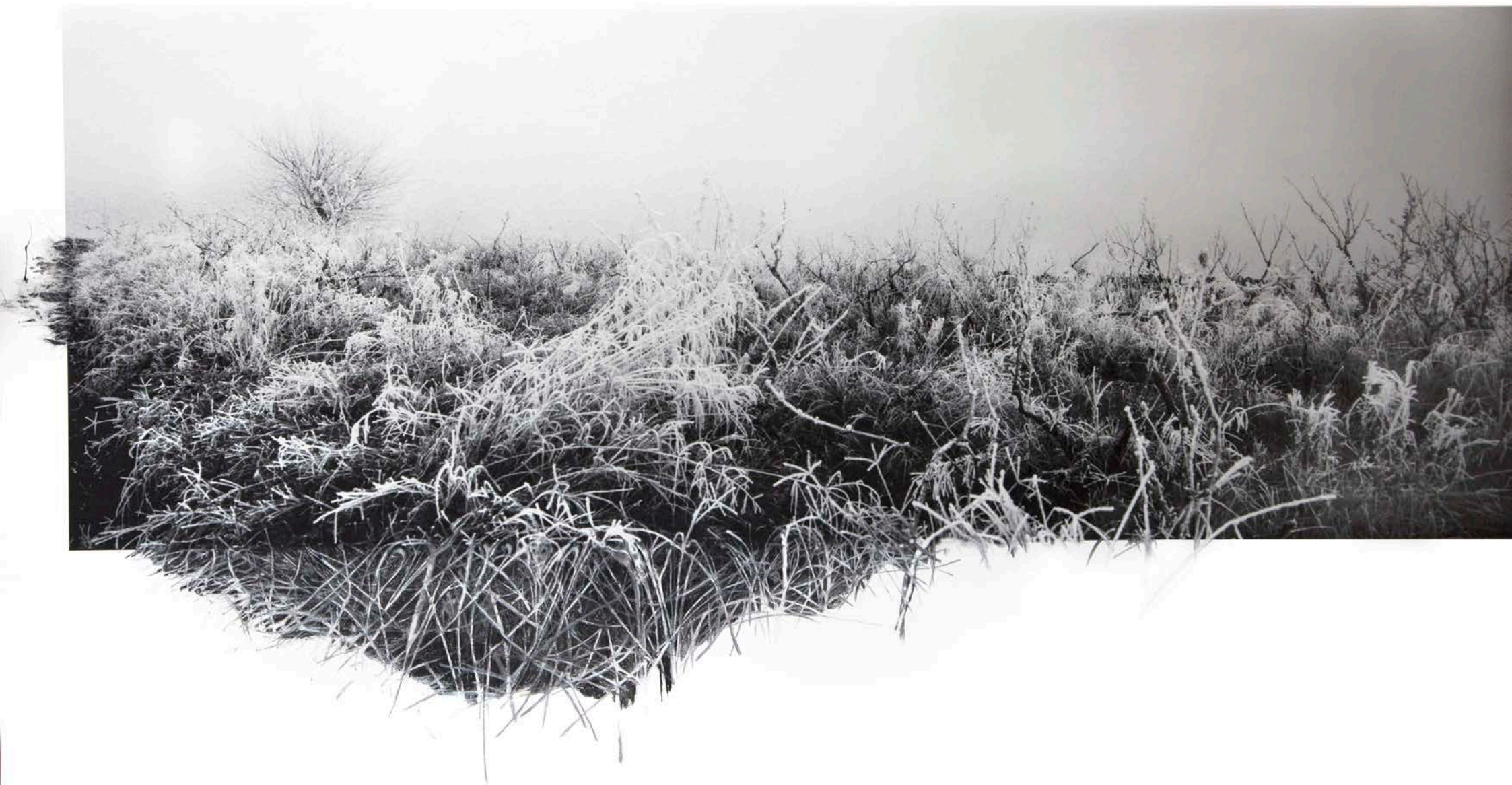
Dana Cojbu Strange place for sunrise , 2024 inkjet pigment print, charcoal and dry pastels 70 x 100 cm