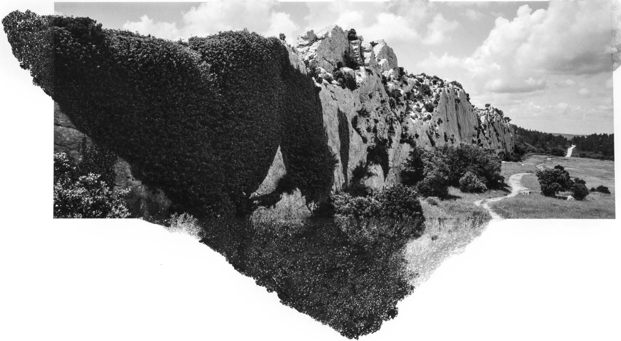
Dana Cojbcu Untitled 2024 inkjet pigment print, charcoal and dry pastels 47 x 67 cm