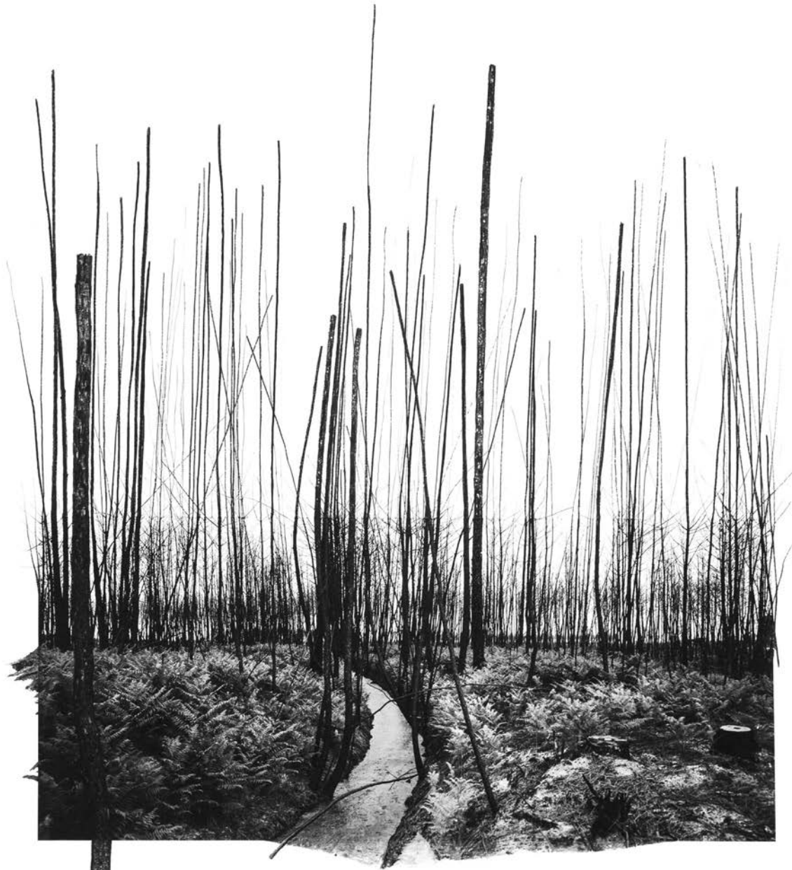
Dana Cojbc Untitled , 2024 inkjet pigment print, charcoal and dry pastels 80 x 60 cm